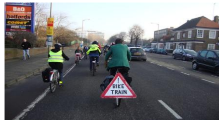
Wheelie saying something... Bike Train breezes down Lewes Road