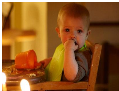
Chairman of the board...