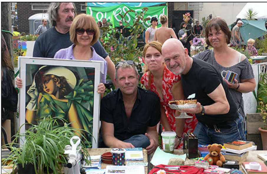
Members of the Triangle Community Group at our stall

On 20 September the Triangle Community Group and Lewes Road Community Garden hosted a wonderfully uplifting "Streets For People Party". We had markets, bouncy castles, wacky cycle races, live music, the launch of the Lewes Road Clean Air Group, and lashings of community spirit. The Triangle's cake and bric-a-brac stall raised nearly £100, which will help hugely towards continuing our projects. Thanks to everyone who joined in – we couldn't have done it without you!